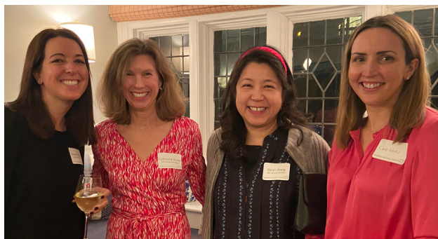
BEF Board Members enjoy gathering in-person.